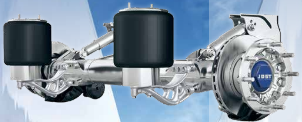
DCA – Durable Compact Axle