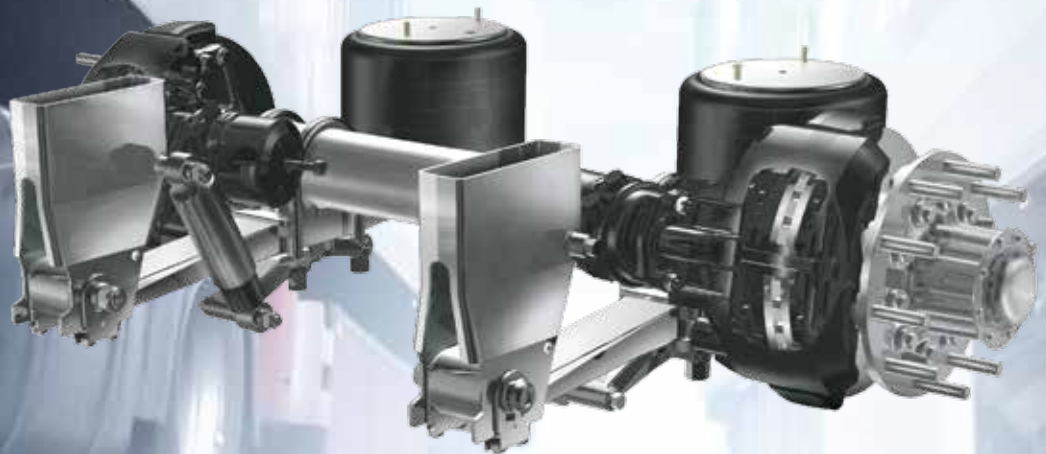
DLS – Durable Leaf Suspension